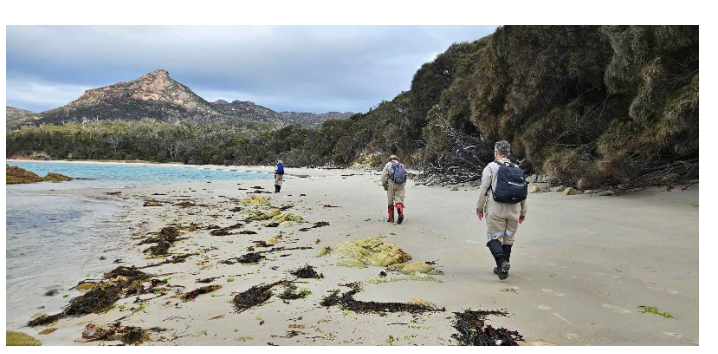
back on Moreys Beach, nearly home

Due to changing weather conditions later in the week, the group was extracted from the island on Monday 18<sup>th</sup>. This meant we only had five days weeding, not enough time to cover all areas, but we did tackle the worst areas, and even managed a trip to the western side of the island weeding as we went.