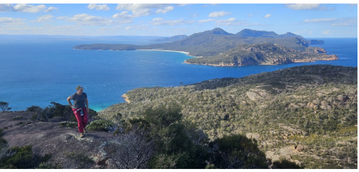
the view from Bear Hill across to the peninsula