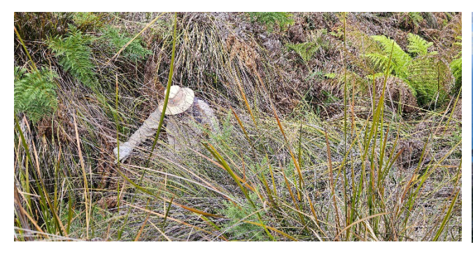
sometimes it's hard work getting to the gorse

Downtime saw plenty of swimming, strolling along the beach, and a trip up Bear Hill for some.