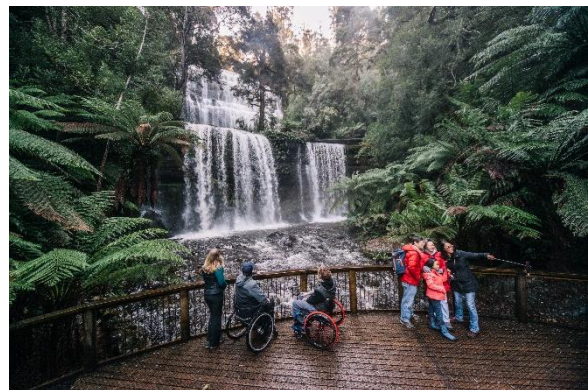
Russell Falls - PWS

Photographers will enjoy the diversity of Mount Field NP. Seasonal changes bring with them new sights – flowers and leaves change; birds become more vibrant during their breeding months; waterfalls become even more spectacular after rain. In Autumn, the alpine areas blaze with the ‘turning of the Fagus’ – the Deciduous Beech, which is Australia's only winter deciduous tree.