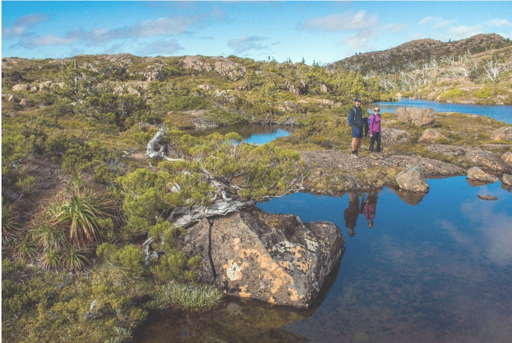
Tarn Shelf