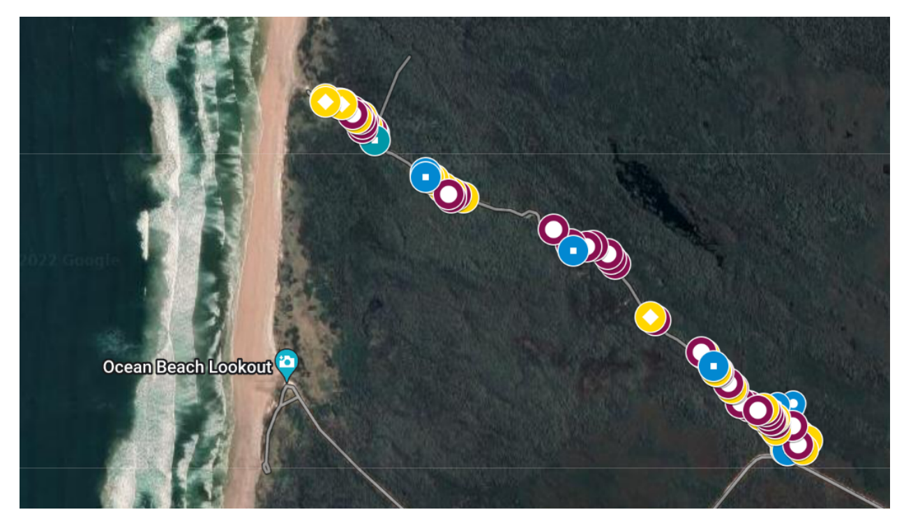
Figure 2: Survey of Montpellier Broom Prior to Weeding.