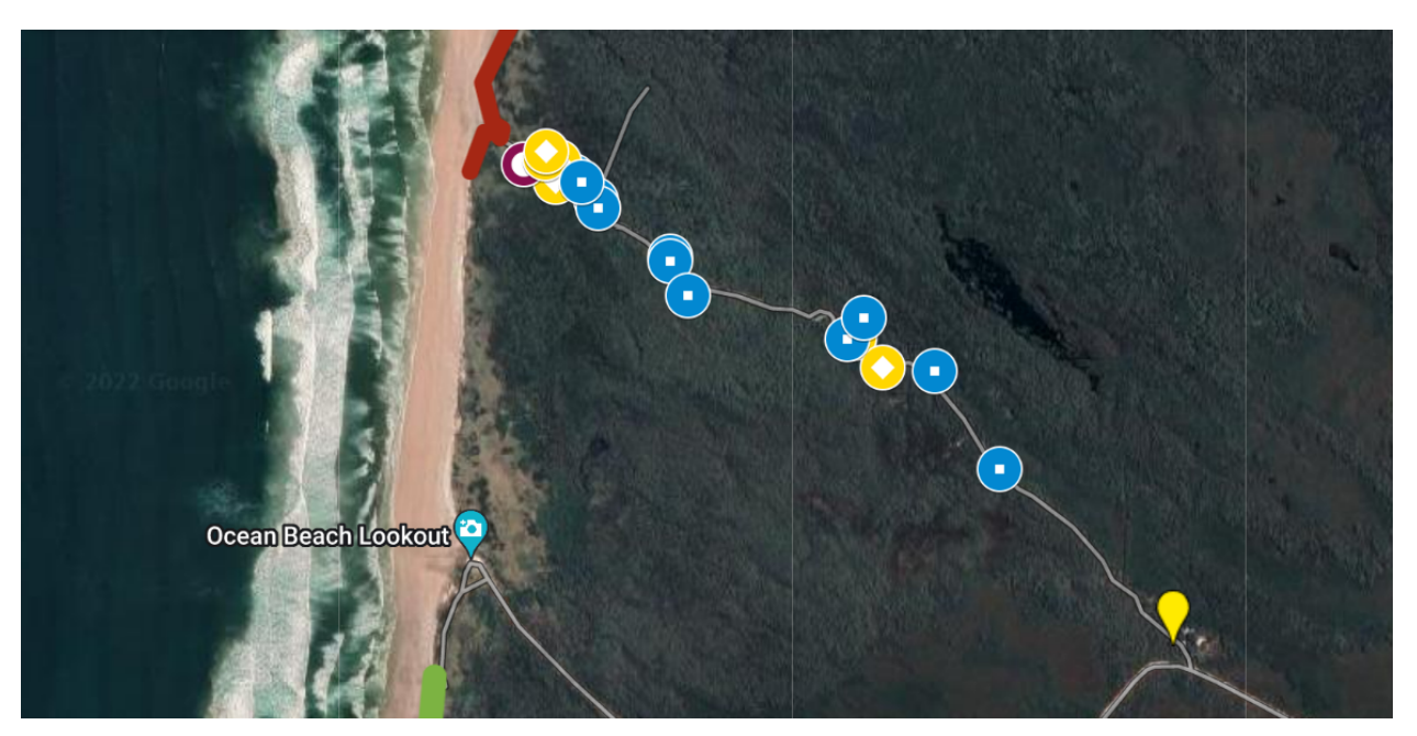
Figure 1: Survey of Montpellier Broom as of the Last Working Bee (April). Blue marks small plants, yellow marks medium sized plants, red marks large plants. Yellow marker marks a single large cabbage tree. Red line marks sea spurge.