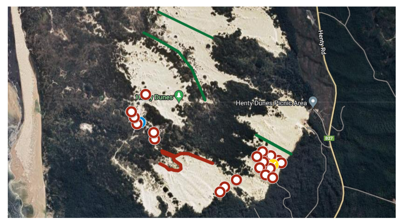
Figure 4: Lupines at Henty Dunes. Each Red dot marks patches of 1 to 100 mature lupines. Red line marks approx 2000 mature lupines. Green lines mark current lupine-free boundaries.