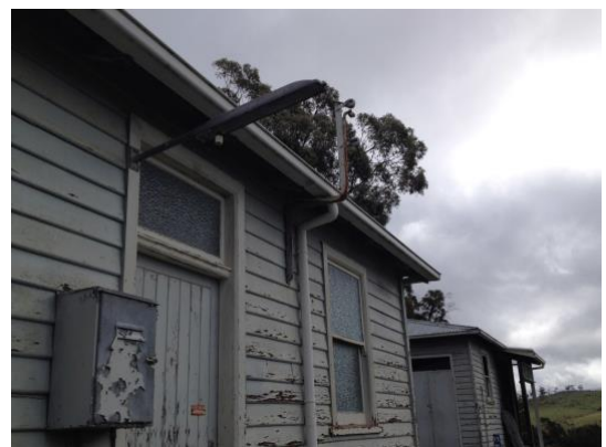
Example of paint restoration required one of the buildings.