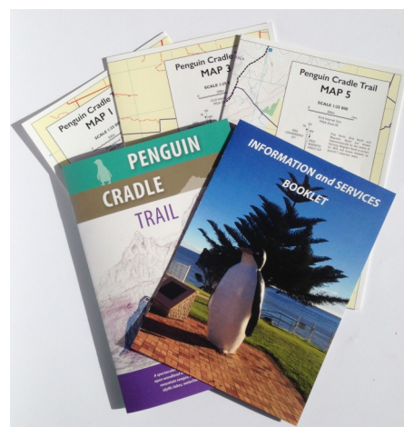
Available from the WILDCARE shop

booklet have increased over the last couple of months with a lot from Tasmanian bush walkers keen to explore locally.