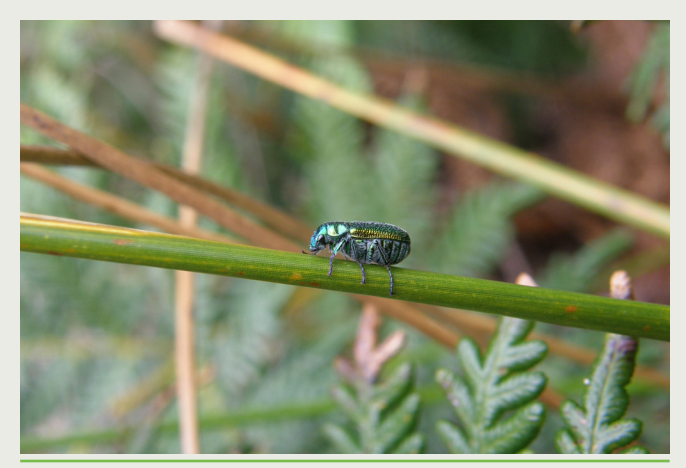
JEWEL BEETLE

Thank you to Wildcare volunteers, including Friends of Mt Field and Friends of Penguin Cradle Trail, who support the care of wild bushwalking tracks.