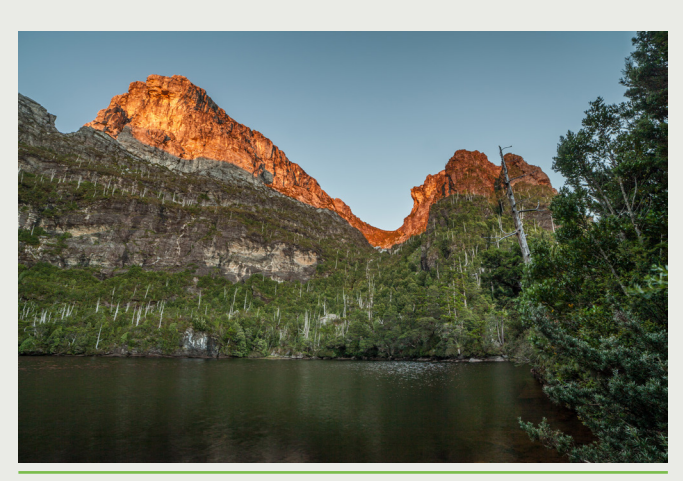
FRENCHMAN'S CAP - PHOTO COURTSEY OF TASMANIA PARKS AND WILDLIFE SERVICE