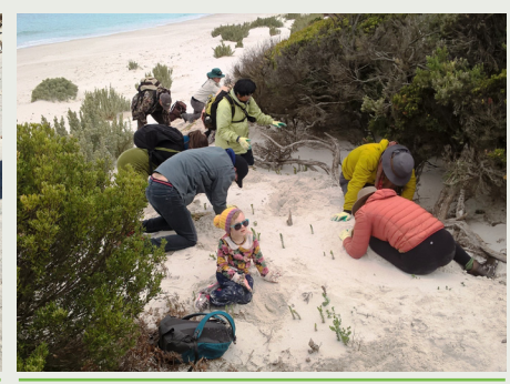
CONVERGING ON THE SPURGE

The larapuna/Bay of Fires area is the much loved, jewel of the Break O'Day region. The area is cleaner and healthier after this year's larapuna Community Weekend. Over 120 volunteers and Parks and Wildlife Service staff walked approximately 50km along the beaches north and south of Eddystone Point, soaking up the landscape and scouring the beach for marine litter and sea spurge.