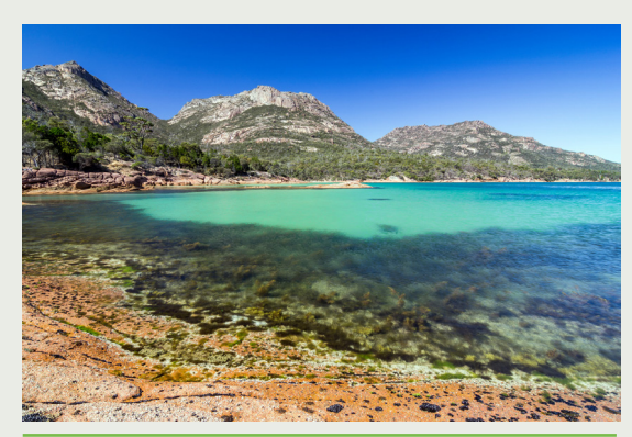
VIEW OF THE HAZARDS, FREYCINET NATIONAL PARK