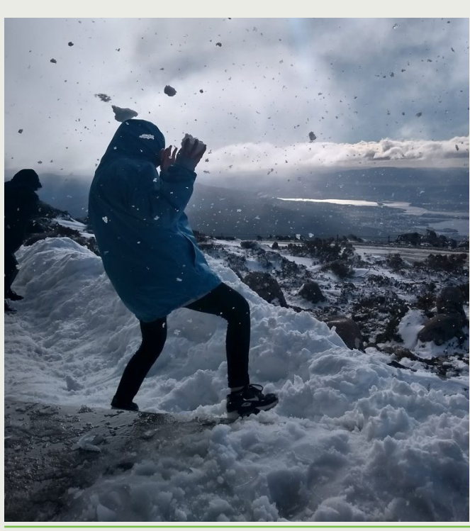
'GET OUTSIDE' SNOWBALL FIGHT

Most Tasmanians are used to having a bonfire – often celebrating the longest night of winter with one. Imagine for a moment that you are new to Tasmania, new to the southern hemisphere, and new to living at 42 degrees south where the nights in winter are long. You wonder where all the people have gone!