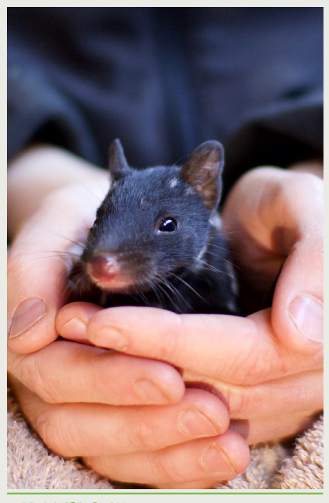
ORPHANED QUOLL BONORONG WILDLIFE SANCTUARY

You can support the cause at www.wildcaretas. org.au/donations/wildcare-bonorong-fund