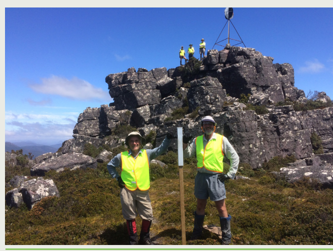
PENGUIN CRADLE TRAIL VOLUNTEERS

It is available in the Wildcare online shop and includes five A3 maps that detail each section including campsite information, history, flora, fauna, geology as well as times and distance. The money made from the sale of these packs helps the volunteers conduct further necessary work. The Wildcare Friends of the Penguin Cradle Trail holds regular working bees which all Wildcare members are welcome to attend.