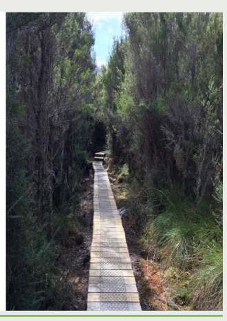
FRENCHMAN'S CAP BOARDWALK IMPROVEMENTS