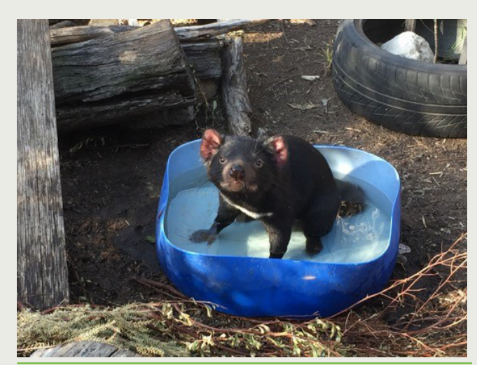
TASMANIAN DEVIL RESEARCH