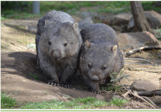
TWO WOMBATS BY KELLIE LOVELL

Around 300 community volunteers help with the native animal rehabilitation. They first learn specialised skills that mimic life in the wild. These skills are quite different to those required for looking after domestic animals. Wildlife must be prepared for their release back into the wild otherwise their survival can be compromised and the hard work of the rehabilitator can be wasted.