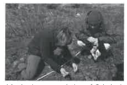
Monitoring a population of Caladenia orientalis: a threatened species in Victoria

threatened orchid populations; this activity is to be conducted by professionals.