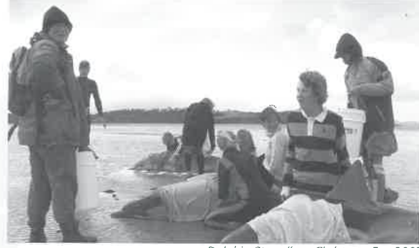
Dolphin Stranding, Christmas Eve 2007 sit a hauled out elephant seal.

Response team is provided free of charge by the Tasmanian Parks and Wildlife Service at several locations around the State each year in partnership with Wildcare and DPIW. Trained volunteers are then invited to join our First Response Team through Wildcare which maintains the database. These are the volunteers called out to strandings.