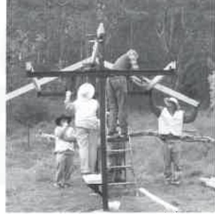
Green Corps team working with the trail as, well as signage to direct Wildcare Volunteers at Warrawee Forest

The Green Corps team is also building a large picnic shelter next to the Platypus Pool (Hedditch Lake). The crew members are involved in every step, from the environmental review, planning, risk assessments, surveying and site preparation, material transport, post setting and concrete work up to the roofing and general construction of the shelter. It is inspiring to see their enthusiasm and