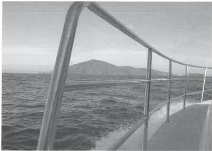
Approaching Maatsuyker Island Aboard 'Velocity

A stiff climb brought us to the Whim shed - missing part of its roof and