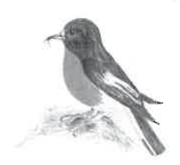
Our resident robin is a little busy-body (drawing by Trauti Reynolds)

Thirsty Country, Options for Australia by Asa Wahlquist (Allen and Unwin 2008)