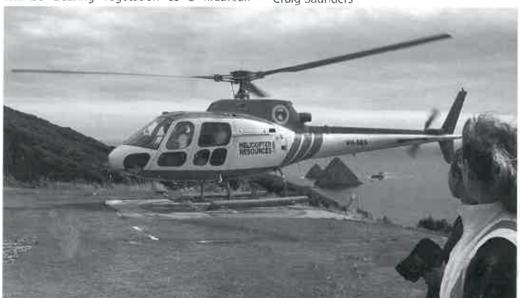
Volunteer Transport Arrives At Maatsuyker Island