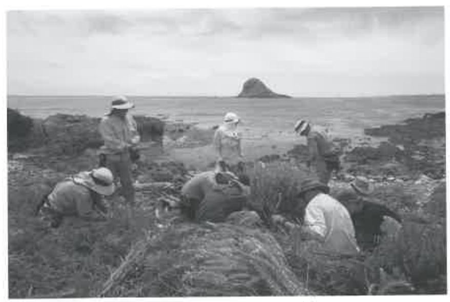
Weeding sea spurge at Meerim Beach

If you are interested in becoming involved, log on to www.wildcaretas. org.au, join Wildcare if you have not already done so, and tick your interest in the SPRATS group.