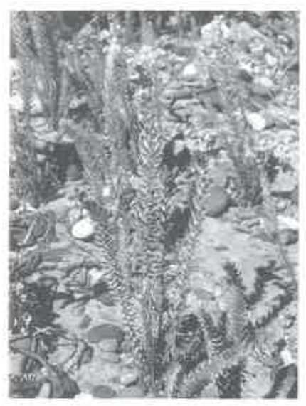
Sea Spurge (Euphorbia paralias)

Boogie boarding and snorkelling at the end of the day have also been mentioned as one of the bonuses of walking all day on a beach, pulling the spurge.