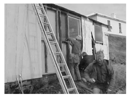
Maatsuyker volunteers replacing cladding on workshop wall.

re-roofing and re-walling the 'red shed', (used as a gas bottle storage), re-cladding and framing a wall of the workshop, re-building a fence at the head light keeper's house (Q1) and replacing rotten underfloor timbers in the same building.