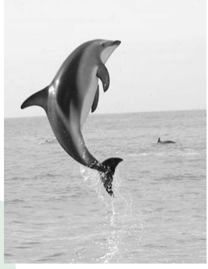
An aerobatic Dusky Dolphin.

and professional development through action learning and i m p r o v e d environmental and c u l t u r a l understanding. This seeks to reinforce KPMG's commitment environmental stewardship