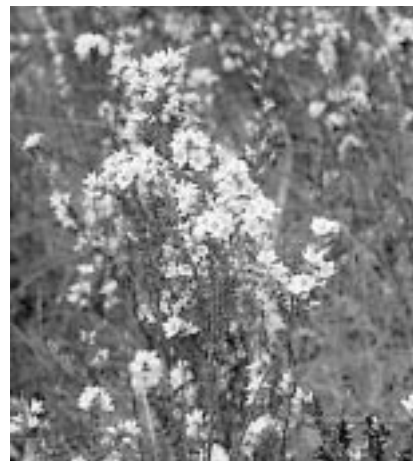
Pretty Heath ( Epacris virgata 'Kettering').

working together to remove the pine trees and other weeds from the site. The Kingborough Council and the Parks and Wildlife Service have been removing the large trees on the edge of the patch of Pretty Heath. During a WILDCARE working bee held in June, the Landcare group, Community and WILDCARE members removed the smaller trees from within the patch of threatened plants. 20 volunteers attended and worked solidly