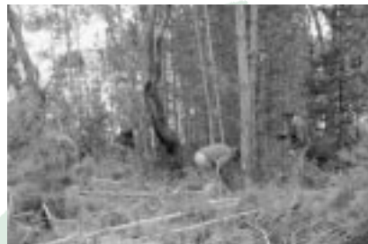
Cutting the pines down.

The Kingborough Council, Kettering Landcare Group the Parks and Wildlife Service, community members, WILDCARE and the Threatened Species Unit have all been