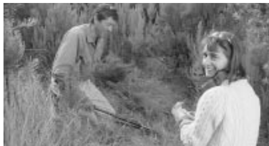
Removing Spanish Heath ( Erica lusitanica ) invading Snake Island.

FOSI recently applied for funding through Envirofund to help in eradicating Spanish Heath, and as well has organised two successful working bee weekends (with more to