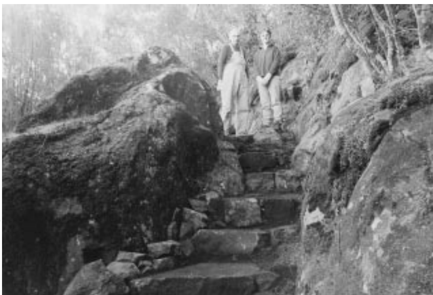
Les & Marilyn Rollins showing off their rock steps.

Les and Marilyn liked this track because it was interesting, with good variation in topography and vegetation, that makes it a worthwhile