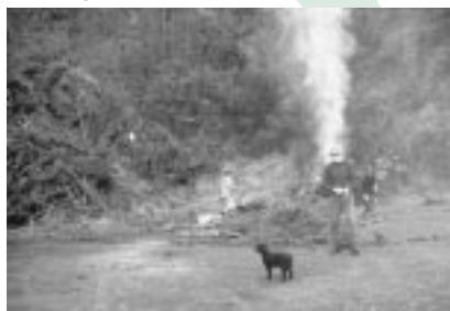
Burning the 'slash'.

If you are interested in attending a working bee in October contact Paul Black in the Threatened Species Unit after 23 September on 6233 6996 or <Paul.Black@dpiwe.tas.gov.au>.