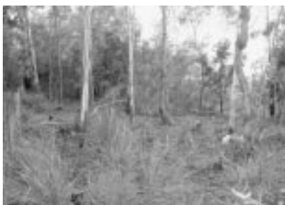
After working bee.

natural regeneration of native species where possible and planting native species in places where natives will not re-establish on their own. The work will be monitored and followed up annually to remove any regrowth of weeds. This should allow Pretty Heath to expand its range back into areas that it formally occupied.