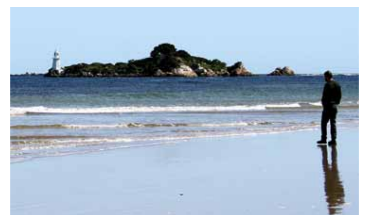
Lakes Entrance Lighthouse