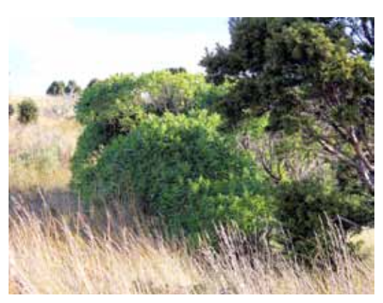
Boobialla Myoporum insulare planted by Anne Landers 1969

Jonguils and wild daffodils were in full flower in the gardens of Q1 and Q2. As well, several clumps were found between and around Q3 and Q2, a few clumps in the rank grass east of Q1 and towards the waterhole. Dozens of clumps were in the bracken patch, all within the original fenceline. All