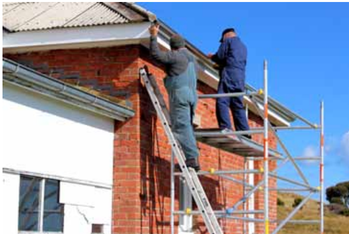
Keith Darke & Ron Fehlberg installing new gutters at Q1

The grass had grown very little since our last visit. Grass was cut around the helipad, houses, weather station and tracks between buildings. A broken solar panel bracket was noticed on the BOM weather station. The Bureau of Meteorology was contacted and spare parts delivered on the first flight on the 25<sup>th</sup> and FoTI effected