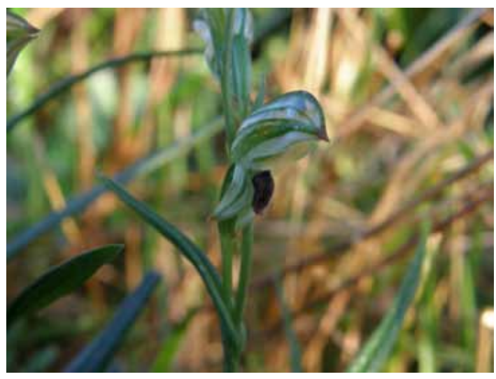
The green orchid is a new record for Tasman.Pterostylis williamsonii, common name for brownlip greenhood

(this is not just any old weeding report, read on!)